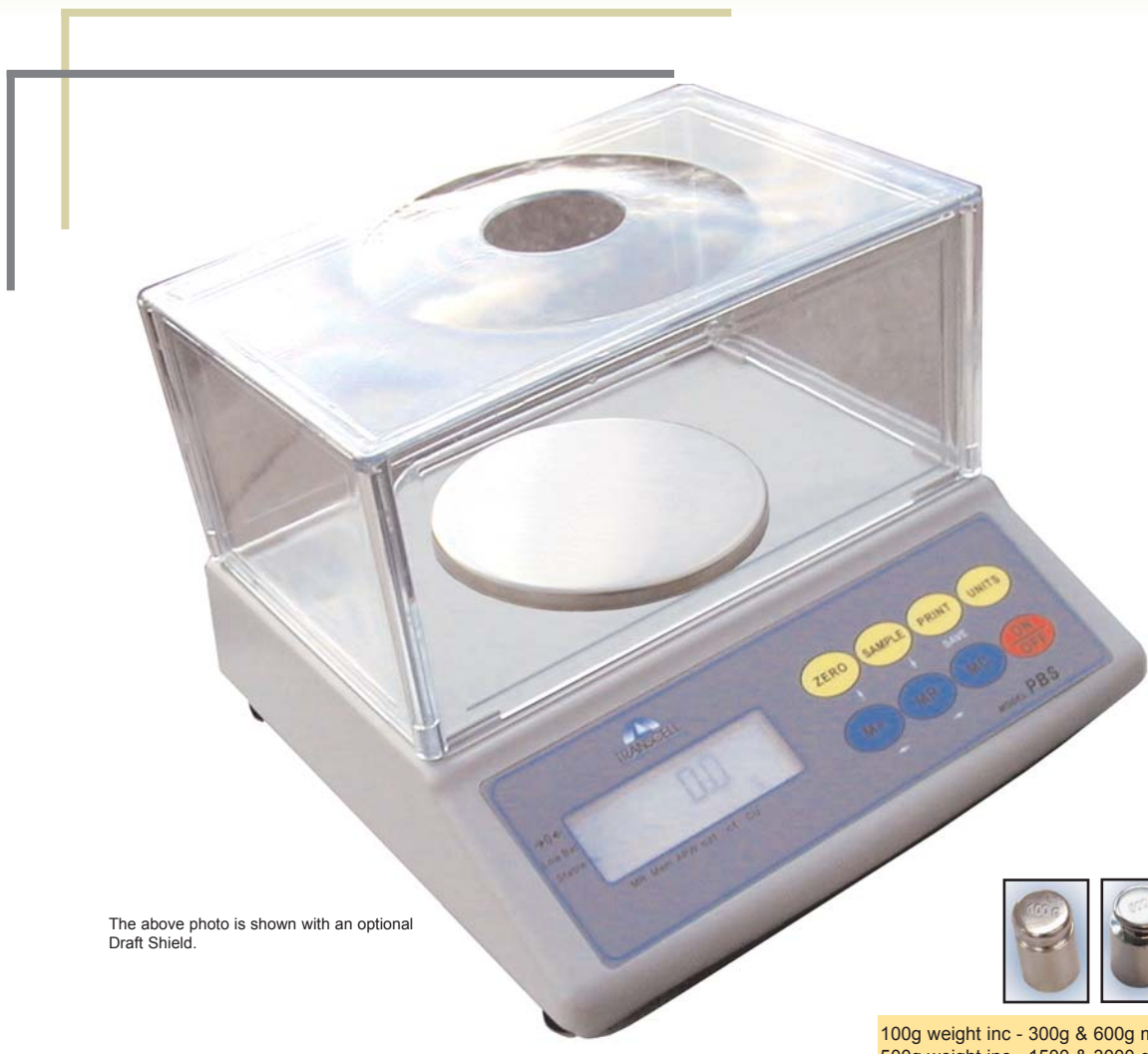
The above photo is shown with an optional Draft Shield.