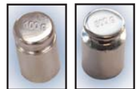
100g weight inc - 300g & 600g model 500g weight inc - 1500 & 3000 g model

Precision weighing has never been easier. The Transcell PBS is both an affordable and portable balance designed for the classroom, laboratory and industrial applications. Standard functions include 1:30,000 displayed resolution, a large, high contrast LCD display, and digital calibration. With weighing modes that include g, lb, oz, ct, ozt, dwt, and parts counting, PBS users have the versatility that is needed for a multitude of applications. A precision calibration weight is included to maintain maximum accuracy and performance.