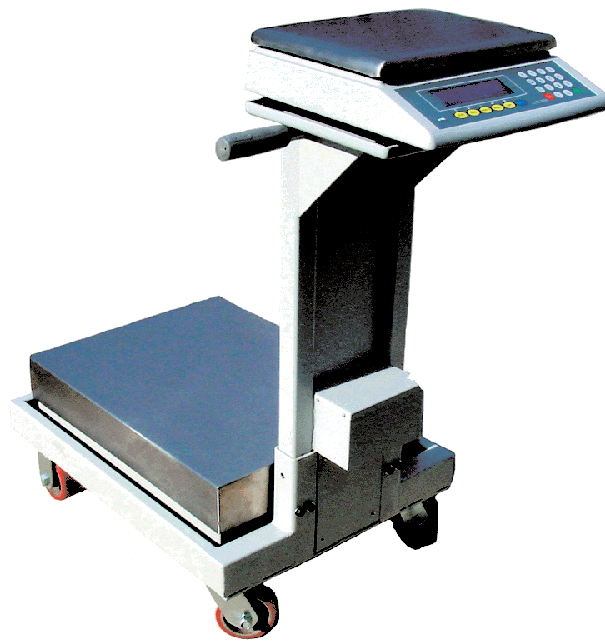
TP-500-2005 or TP-500-2010

Includes: * cart with counting column * 18" x 24" base * TC-2005 or TC-2010